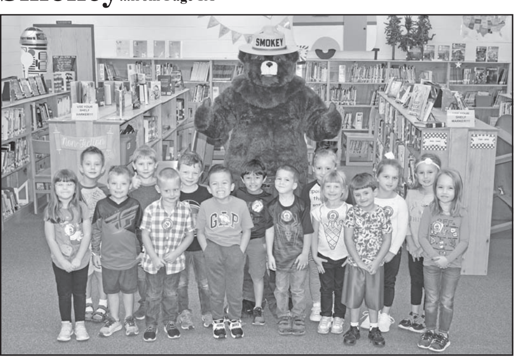
Last month, Smokey Bear posed for many pictures with excited youngsters who helped him celebrate his 75th birthday at Towns County Elementary.

Bear heard them calling and children about fire safety and to learn about fire safety at a appeared to the delight of the gave the kids some useful tips children, who then received the opportunity to wish Smokey a happy birthday.